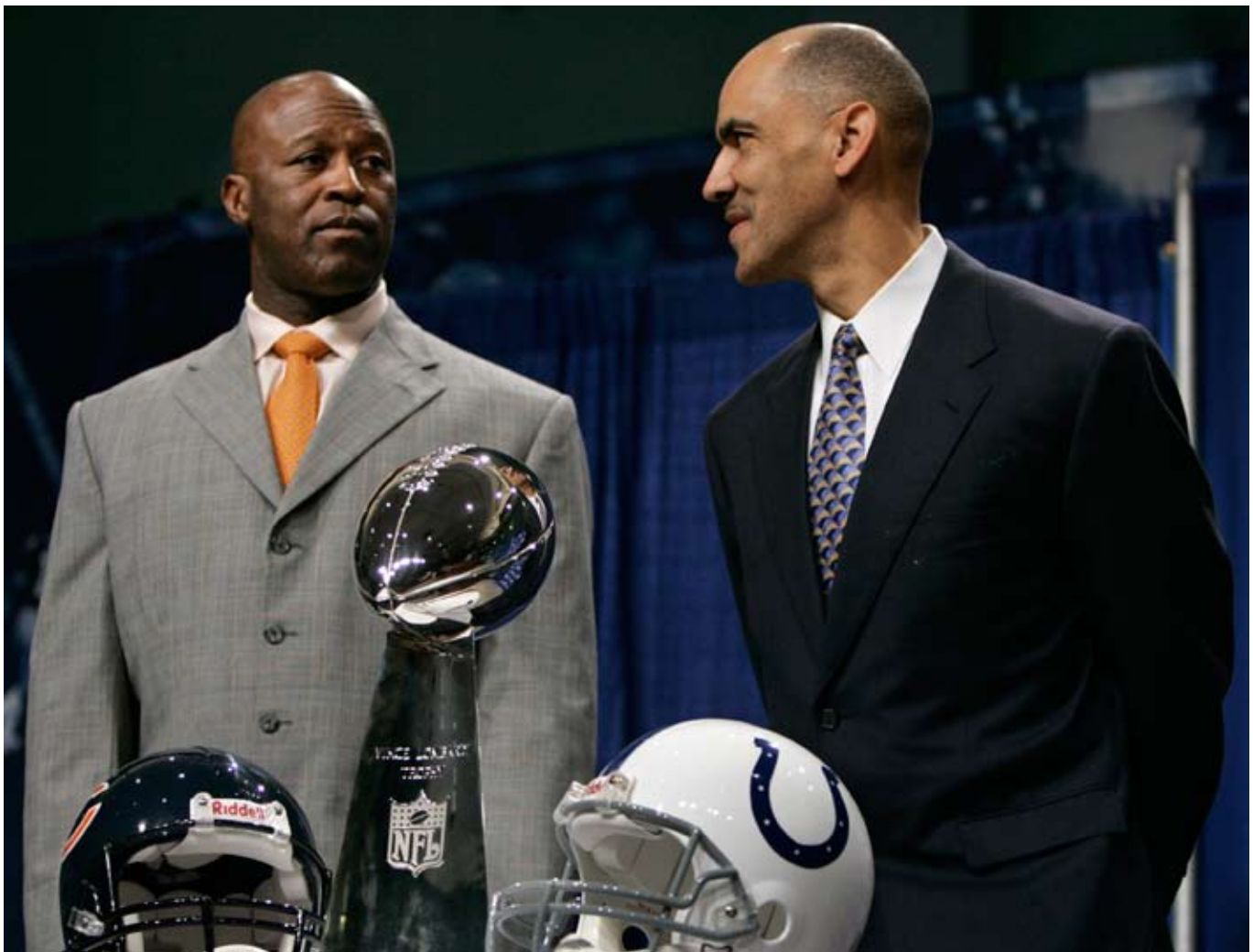
Indianapolis Colts coach Tony Dungy, right, and Chicago coach Lovie Smith pose with the Vince Lombardi Super Bowl trophy during their press conference at the Miami Beach Convention Center in Miami Beach, Fla., Friday, Feb. 2, 2007. The Indianapolis Colts will play the Chicago Bears in Super Bowl XLI on Feb. 4.

The focus of the game may have been on the rain-drenched players on the field, but Smith and Dungy have also inspired us through their deep moral conviction and their perseverance in refusing to let the obstacles in their lives deter them from achieving success. Their achievements demonstrate progress in working toward the dream once