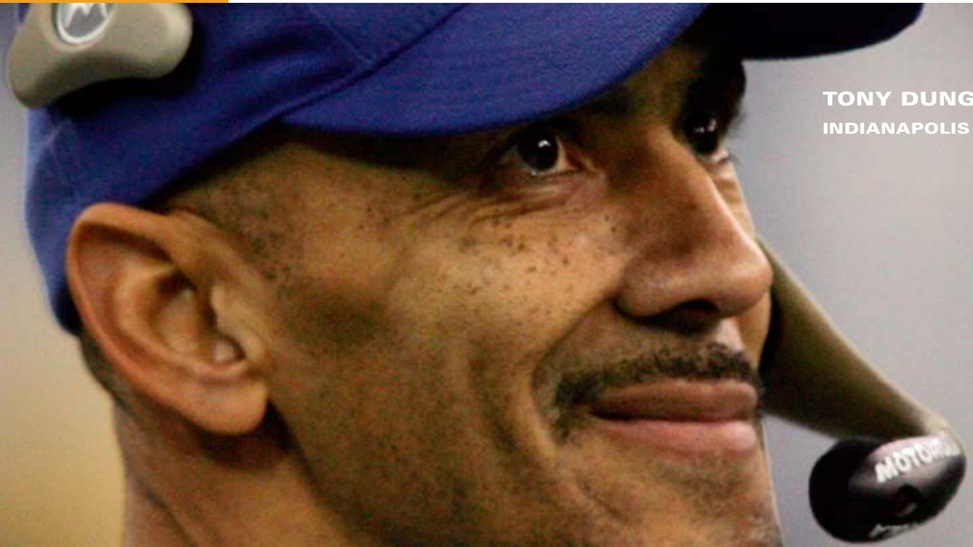
TONY DUNGY INDIANAPOLIS COLTS

FOSTERING CITIZENSHIP THROUGH CHARACTER EDUCATION