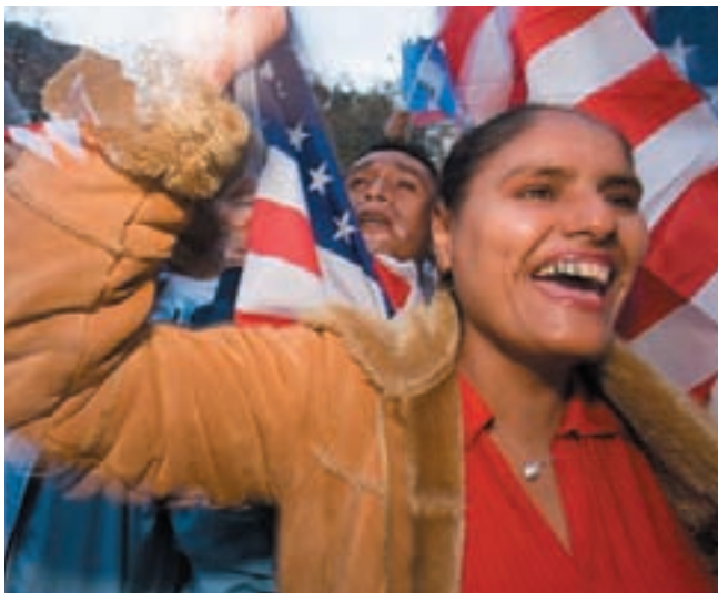
People gather for an immigration rally Monday, April 10, 2006, in Los Angeles.

our nation? (Please list on the board) What are the disadvantages? (Please list on the board)